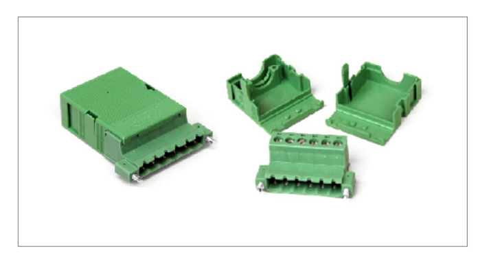
2280-001: Rear Panel Mounting Connector and Cover (assembled view on the left, and connector and top and bottom cover shown separately on the right)