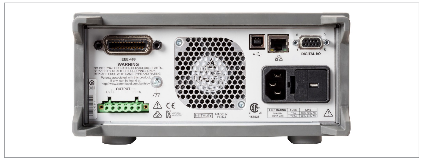
Figure 7. 2281S rear panel.

controlled via their built-in GPIB, USB, or LAN interfaces. The USB interface is test and measurement system (TMC) compliant. The LXI Core compliant LAN interface supports controlling and monitoring a Series 2281S supply remotely, so test engineers can always access the power supply and view measurements, even if located on a different continent than the test systems.