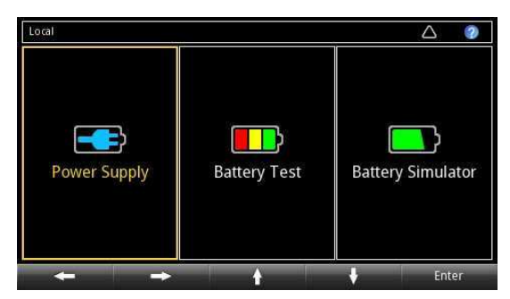
Figure 1. Series 2281S startup screen.

The 2281S uses linear regulation to ensure low-output noise and superior load current measurement sensitivity. A high resolution color thin film transistor (TFT) screen displays a wide range of information on measurements. Soft-key buttons and a navigation wheel combine with the TFT display to provide an easy-to-navigate user interface that accelerates instrument setup and operation. In addition, built-in plotting functions allow monitoring trends such as drift. These features provide the flexibility required for both benchtop and automated test system applications. In addition, the 2281S provides a list mode, triggers, and other speed optimization functions to minimize test time in automated testing applications.