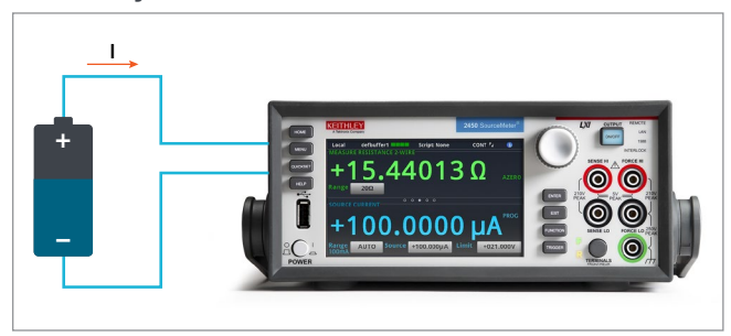
Use a Keithley 2450 or 2460 Series SMU with a model generating test script to discharge batteries and create battery models for the 2281S-20-6 Battery Simulator.