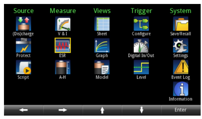
Figure 6. Battery test menu.

The bright, 4.3-inch TFT display shows voltage, current, and amp-hour readings, source settings, and many additional settings in large, easy-to-read characters. The icon-based main menu provides all the functions users can control and program for fast access to source setup, measurement setup, display formats, trigger options, and system settings. Menus are short, and menu options are easy to find and are clearly described, enabling test parameters to be setup quickly by using the navigation wheel, keypad, or soft-keys. Many setup parameters, such as voltage and current settings, can be entered directly from the home screen. Less complex tests don't require access to the main menu to make adjustments - just use soft keys on the home screen. Whether test requirements are simple or complex, the Series 2281S supplies provide a simple way to set up all required parameters.