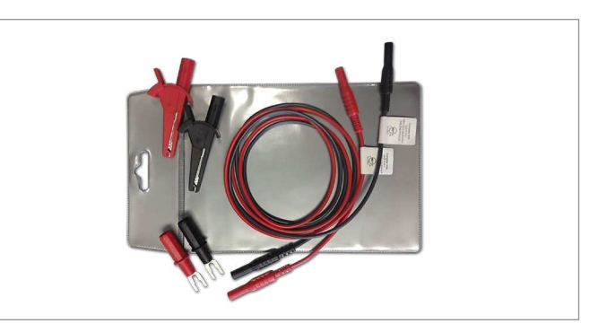
2280-TEST-LEAD: Power Supply Test Lead Kit, 1000 V, 20 A Rating: Contains 122 cm (4 ft) of cable, spade lug adapters, and alligator clips